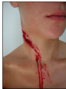
Ref : PR02