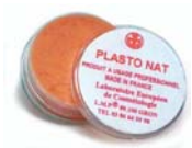
Ref. 2026 17ml

➔ Make-up remover: We recommend to use the MAKE-UP REMOVER JELLY (ref.1041 to 1043/A) to get rid of the colouring and to take off everything use a cotton wool and adhesive and latex Solvent (réf.2023 to 2023 /C).