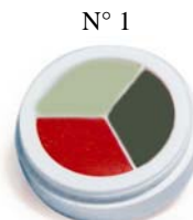
Réf. 1003 / C 6 ml N° 1 paleness/red/khaki N° 2 yellow/blue/blood-red N° 3 yellow/blue/black N° 4 red/paleness/black