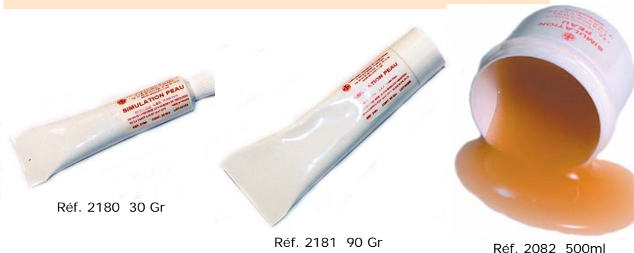
Réf. 2180 30 Gr

➔ Make-up remover: With a cotton wool and adhesive and latex solvent (réf.2023 to 2023 /C).