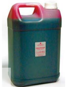
5 000ml Ref. 2005/A