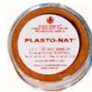
Ref. 2027 29 Grsl