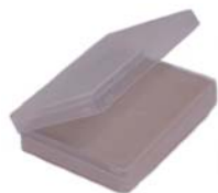
Réf. 1000 Li of 50g

➔ Make up remover : with the make up remover jelly Réf. 1041, the Cleaner Réf. 1034 or the make up remover milk Réf. 1038 /A