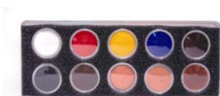
Réf. 1003 50ml pallet OF 10 colors * Cups Réf. 1003.A 5ml reload for pallet