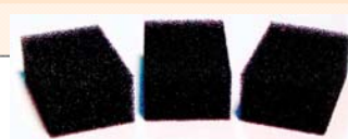
Réf. 1061 / A

With the bruisse sponge it makes possible to realise the effect of vessels burst on the point of impact, for this effect, one uses the CREAM BLUSHER can also be used for to make beads of sweat with the perspiration liquid.