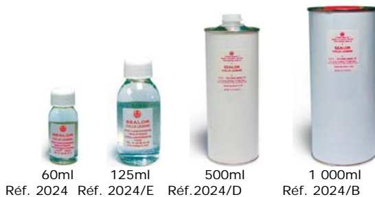
60ml Réf. 2024 125ml Réf. 2024/E 500ml Réf.2024/D 1 000ml Réf. 2024/B

➔ Make-up remover: With a cotton wool and adhesive and latex solvent (réf.2023 to 2023 /C).