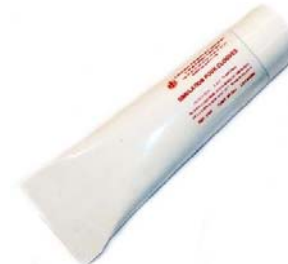
Réf. 2151 90 G