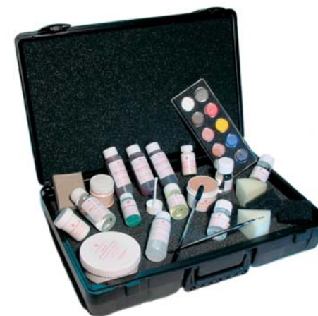
MSP 02 Ref. MSP 02

*Cream blushers colours: black-white-yellow-red-blue-blood red-khaki-pale flesh tone-medium flesh tone-dark flesh tone