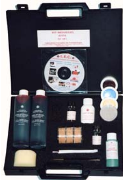
Rigid case with foam of protection

This kit is perfect for exercises and operations.