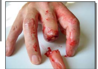
Ref : PR08