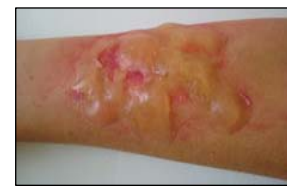
Ref : PR07