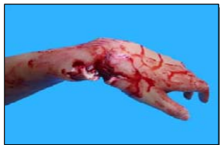
Ref : PR01

To create large wounds on multiple victims of disaster for instance we recommend using prosthesis: