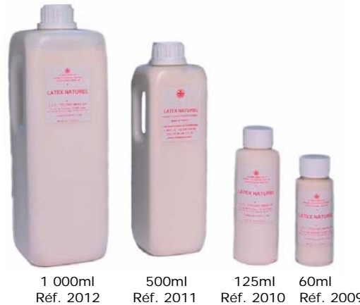
1 000ml Réf. 2012 500ml Réf. 2011 125ml Réf. 2010 60ml Réf. 2009

Caution: Never apply near the eyes or the mucous membranes.