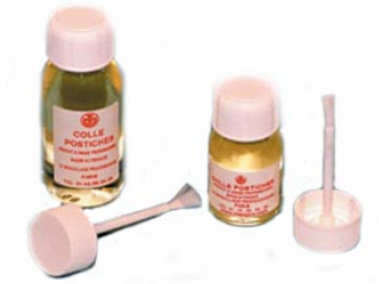
60ml Réf. 2016 30ml Réf. 2015

Caution: Never apply near the eyes or the mucous membranes.