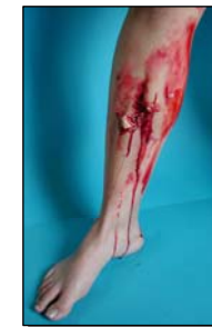
Ref : PR03