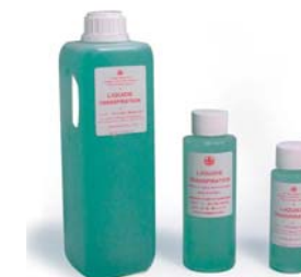
500ml 125ml 60ml Réf. 2029/D 2029 2029/A

➔ Make-up remover : Remove it with water.