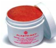
Ref. 2027/A 85ml