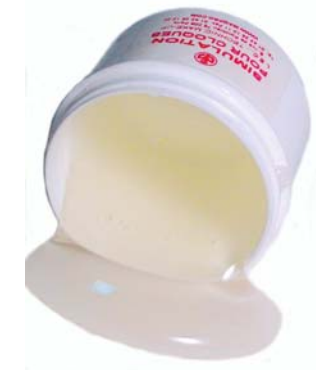
Réf. 2052 500ml