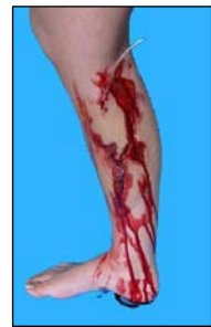
Ref : PR04