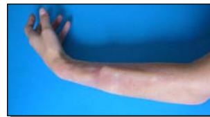
Ref : PR06