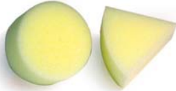
Réf. 1055/A Réf. 1055/B