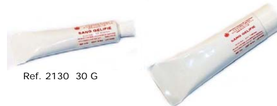
Ref. 2130 30 G

➔ Make up remover: Cleaned with tepid water or the CLEANER (Ref.1034 to 1037/A).