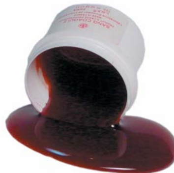
Ref. 2007/A 500ml