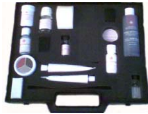
Rigid Case with foam of protection