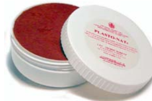
Ref. 2027/B 200ml