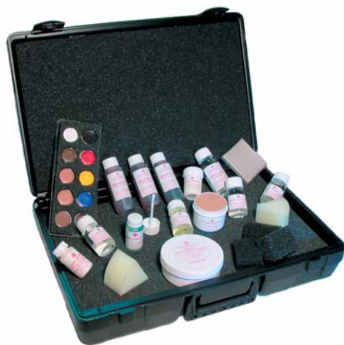
MSP 01 Ref. MSP 01