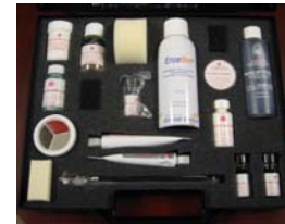
Rigid case with foam of protection