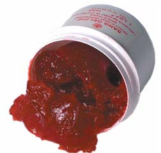
Ref. 2031/A 500ml